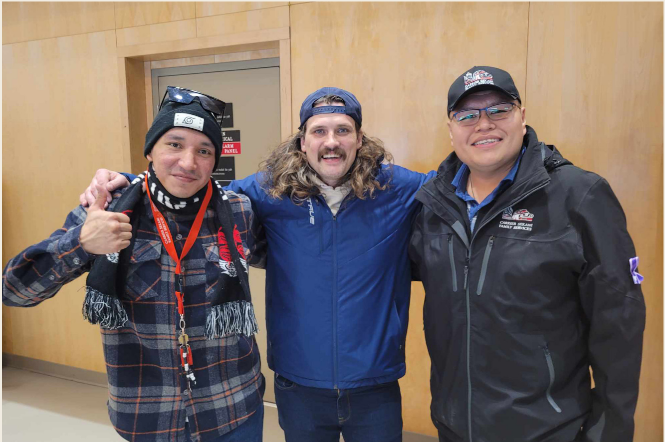
Mens Group Wellness forum in Nadleh, story page 12 inside!