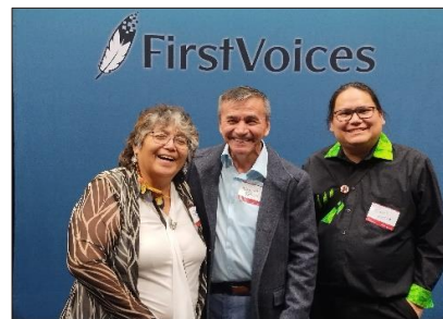
Nadleh Stella FirstVoices Team were invited to 20th Anniversary Dinner on Feb 21, 2024, Victoria, BC